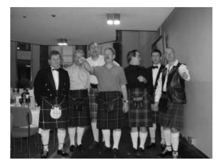
Physical Health SIRG and Mental Health SIRG meeting Glasgow September 2002

Can you guess what is being said? The most humorous response will receive a year's free individual membership for the year 2003.